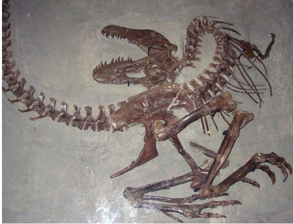
Gorgosaurus skeleton in its burial position in a mudstone. Skeleton about 4m across. From the American Geological Institute, Earth science World Image Bank ( http://www.earthscienceworld.org/images/index.html ). Photo ID: hpdzvh, copyright Abi Howe, AGI.