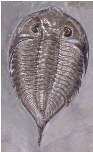
A fossil trilobite of the species Dalmanites limulurus , 7 cm long, found in mudstone of Silurian age (443 – 416 million years old) in New York state (USA). Photo taken by DanielCD. Permission is granted to copy, distribute and/or modify this document under the terms of the GNU Free Documentation License.

Possible answers, for the trilobite shown in the photograph, are: