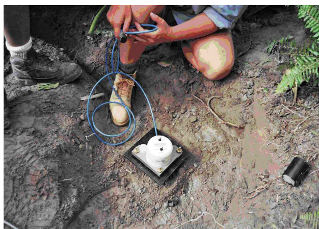
Tiltmeter in use on the volcanic island of Montserrat