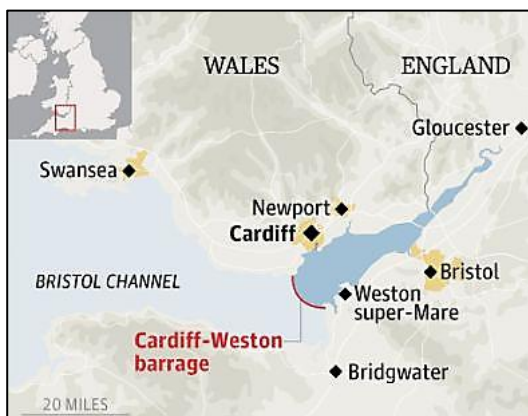
The location of the proposed Severn Barrage

If you live inland, search for an example of an actual or proposed tidal power station on the internet and answer the same two questions. A good example is the proposed tidal barrage across the estuary of the River Severn in England.