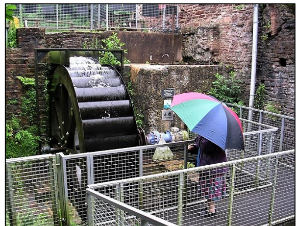
Water wheel installed in 2013 at the Forest of Dean Heritage Centre, Gloucestershire

Estimate the head of water from the outflow of the dam to the bottom of the wheel, if the height from the lady's feet to the tip of the umbrella is about 1.7m.