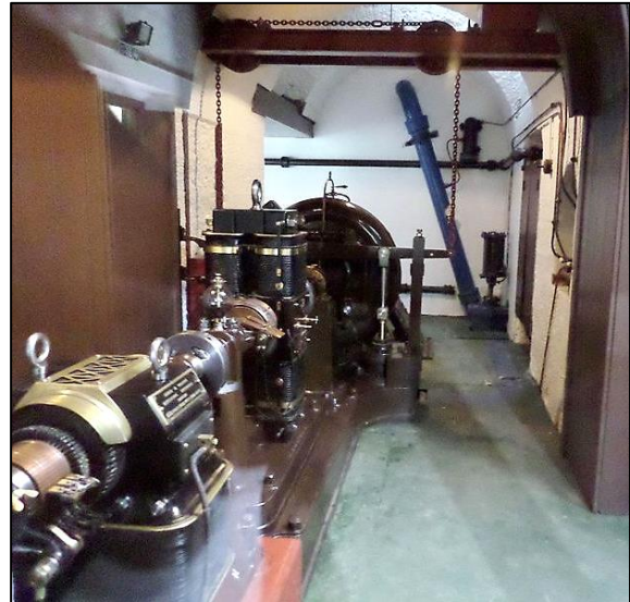
The turbine house at Cragside ( file licensed under the Creative Commons Attribution-Share Alike 4.0 International license )

Falling water can also be used to generate electricity, when it is referred to as hydro-electric power (HEP). The first house in the world to be powered by HEP was Cragside, the country home of an industrialist, Lord Armstrong, in Northumberland in 1878. Although a simple water wheel can be used to generate electricity, it is more efficient to use a turbine, where the blades are curved and are confined within a tubular metal casing, as at Cragside. In principle, all it needs is a reliable flow of water and a sufficient "head" of water. The head is the drop in height from the water source to the water wheel or turbine. This small scale invention rapidly led to the development of HEP on a huge scale and it now makes a major contribution across the world. In fact, the world's top six power stations today, in terms of output, are all hydro-electric.