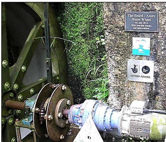
Close up of the generator at the Forest of Dean