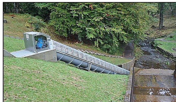
A new 17m long Archimedes screw installed at Cragside (file licensed under the Creative Commons Attribution-Share Alike 4.0 International license)

The micro-hydro equipment in the photographs was installed in exactly the same place below the mill dam as an old water wheel, which had been used to drive a sawmill, before the days of electricity, and which had fallen into decay. Above the dam is a series of old ponds ensuring a good supply of water. The Trustees of the Heritage Centre raised about £50,000 to buy and install the brand new wheel and 7kW generator. The power is used in the Centre and any surplus is fed into the national electricity grid. The Trustees said: "From a green perspective we will be reducing our carbon footprint and generating around £8000 towards our energy costs per annum".