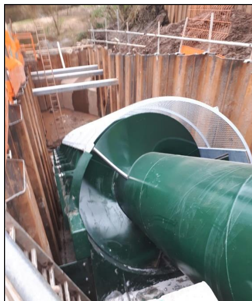
The River Dane Archimedes screw under construction (March 2021.)

The Dane Valley Archimedes Screw: The Dane Valley Community Energy scheme has installed an Archimedes screw in the river Dane, in Cheshire. There is a head of water of 4m and a steady year-round flow from the river. The total costs of the project are over £600,000, and the 65kW of electricity which it will generate has been bought by a large local firm. As a community project, £5,000 per year will also go to local charities, and provision has been made for education of local children and community groups. The pay-back time is expected to be 20 years.