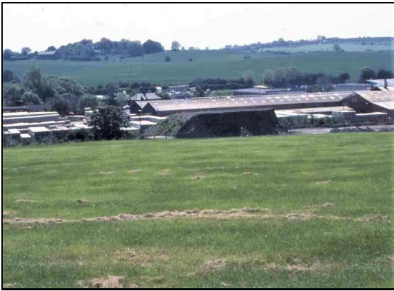
Stairfoot brickworks. The foreground is landfill in a former clay pit. The dark mound is a vast compost heap and finished bricks are stacked to the left of the picture.

A good example of this is at the former brickworks at Stairfoot, 2 miles from the centre of Barnsley in South Yorkshire.