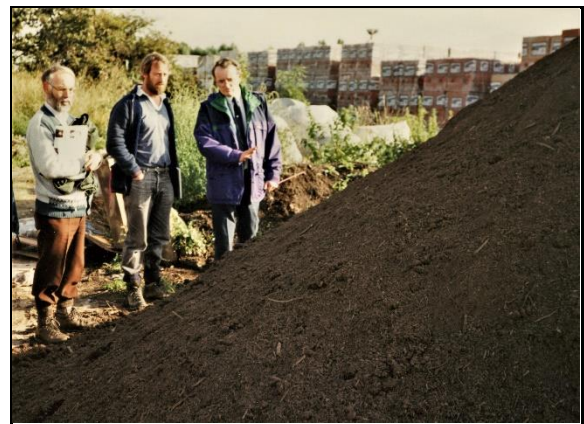
The manager explaining the compost making process. He is holding a long temperature probe for testing the heap.

Finally, the company asked the local council to bring its garden waste from its parks and flower beds to turn into garden compost on a big scale. Some of the brickyard machinery was not in use all the time and could spend a few minutes each day turning the compost heap as it heated up and destroyed the weed seeds.