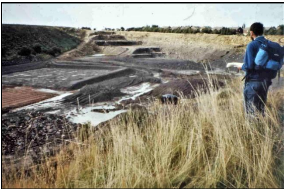
The clay pit being prepared to receive landfill

As their clay pits became exhausted, the firm allowed the town council to use the hole to dispose of domestic waste, containing a lot of organic material. This was done carefully, in cells; pipes were laid to collect the gases and the whole mound was covered with impermeable clay.