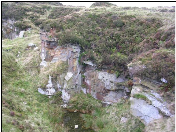
Brown Edge Quarry, Ringinglow, near Sheffield.

Following up the activity: Not all former quarries or brick pits are suitable for landfill. The disused quarry in the photograph below is in attractive moorland in the Peak District near Sheffield. In 1960, Sheffield City Council proposed to use it for landfill, but this was opposed by the Council for the Preservation of Rural England. So a large incinerator was built in the industrial part of the city instead.