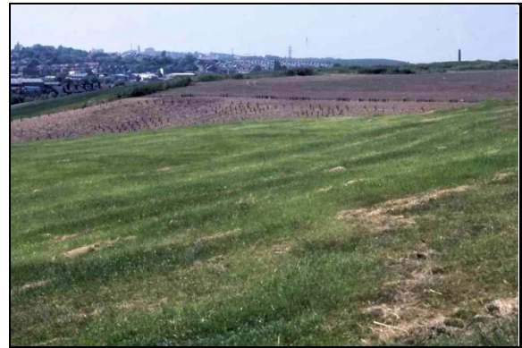
The clay pit reclaimed after landfill. In the foreground it has been grassed over: in the background willow cuttings have been planted.

In addition, the brickworks manager invited the local primary school children to plant willow cuttings on top of the landfill mound. Willow grows very quickly and the intention was for the willow trees to be harvested, chipped into small fragments and used to fire the school's boilers.