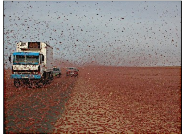
Desert locusts in Morocco