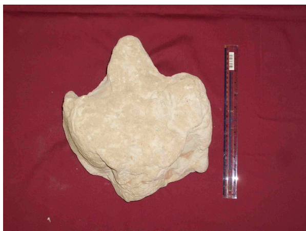
A cast of the fossil footprint of a hind foot of Iguanodon

Pupils should be asked to measure the size of the footprints and also the stride length. They should calculate the average stride length before trying to use the formula to calculate whether the dinosaur was walking, trotting or running.