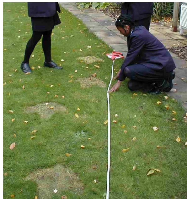
School pupils measure and record a 'dinosaur trackway' on their school lawn!