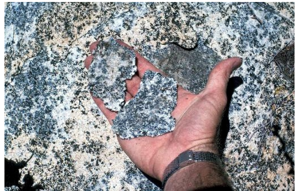
Breaking up of the outer surface of an exposed rock (exfoliation) in an igneous rock, California