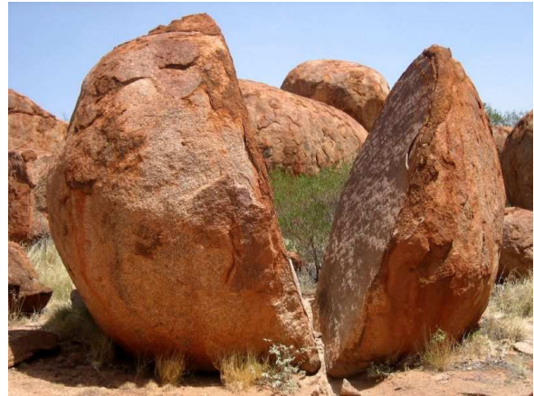
The Devil's Marbles, Australia – a boulder cracked apart by weathering, mostly by extremes of temperature.