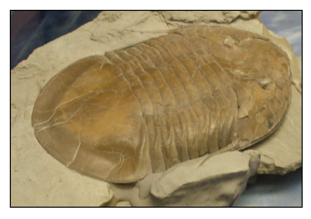
An Isotelus brachycephalus trilobite at the Museo di Storia Naturale di Milano.

This is a picture of a fossil trilobite; it lived on the sea bed around 500 million years ago. This trilobite could swim, but spent part of its time resting on and walking over the sea bed.