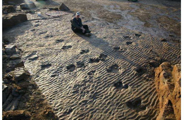
Muenchehagen Quarry near Hannover, Germany. 140 million year-old Iguanadontid and theropod dinosaur tracks on a shoreline.

Now put your thoughts into actions – and make your own dinosaur trail.