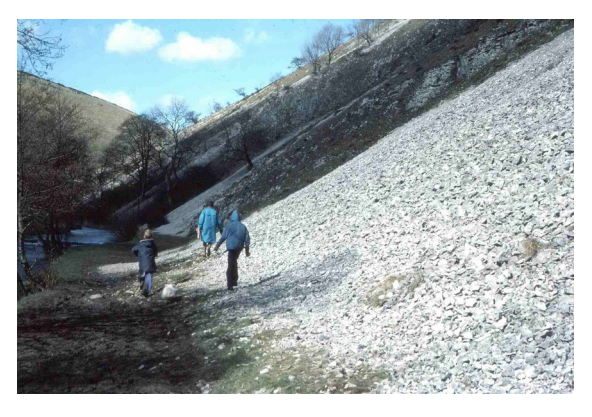
Photograph 1

Show the pupils the photographs on this sheet and invite them to match the pictures to a) the descriptions and b) the explanations of the weathering processes.