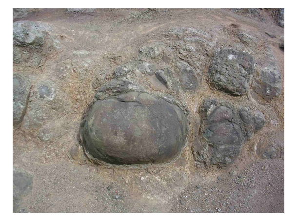
Photograph 5 (Height of section about 3m)