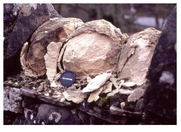
Photograph 4 (The lens cap is 50mm across)