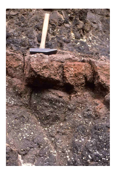
Photograph 9 (The hammer is 40 cm long)