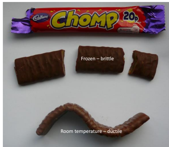
Figure 3: Chomp bars after same force was applied to them. (Pete Loader)