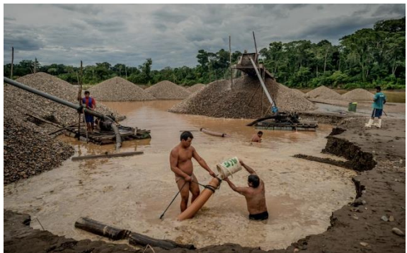
Fig: 5. Artisanal miners at work, separating gold ore from sediments in the Amazon forests