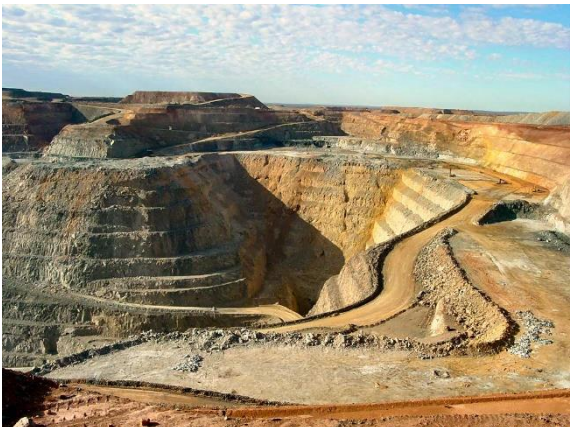
Fig: 1. The Big Pit' at Kalgoorlie, Australia in 2005

What is gold? Gold is a chemical element (Au) with an atomic number of 79 and a very high relative density of about 19. It occurs in veins, known as "lodes' or 'reefs', which may be mined down to great depths.