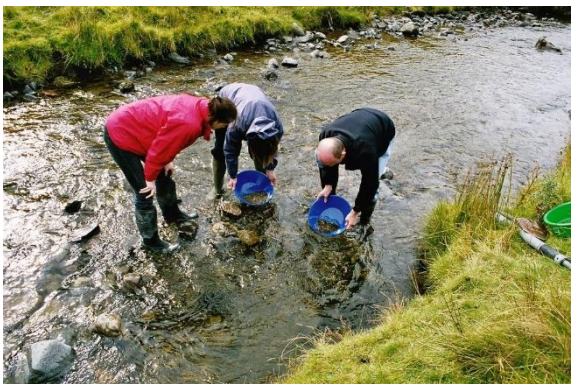
Fig: 2. Prospecting for gold in a British river ( Photo: British Geological Survey P602712 )

The world's most productive such mine is the Muruntau Mine in Uzbekistan (2,000,000 ounces per year). Gold-bearing veins may become weathered and eroded, and the gold deposited along with sands in rivers and the sea. Such alluvial gold deposits are known as 'placers' and the gold may be found by panning, which anybody can do with a simple plastic gold-pan.