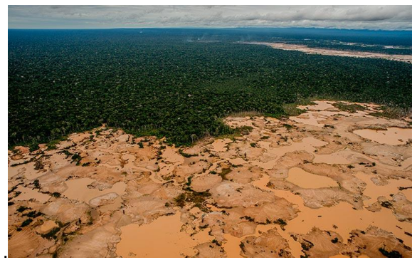
Fig: 4.An aerial view of the results of artisanal mining in the Amazon forests (<u>www.amazonaid.org</u>)

Look at the pictures of artisanal mining in the Amazon Rain Forest and suggest the problems which it may cause. (See "Context" for suggested answers).