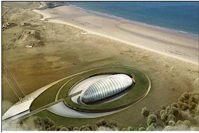
Artist's impression of a seashore SMR (Rolls-Royce publicity brochure)

https://world-nuclear-news.org/Articles/Rolls-Royce-on-track-for-2030-delivery-of-UK-SMR