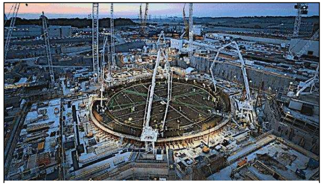
Hinkley Point C, 2019 Press release www.edfenergy.com

Hinkley Point C is the first new nuclear power station built in the UK in 30 years. It is an EPR, (originally European) Pressurised Reactor, a development of the PWR, and thought to be significantly safer than preceding types. The site occupies some 230 acres. There will be two reactors, each producing 1600MW of electricity. Base structures for the two reactors will be 3m thick and will consume some 20,000 cubic metres of concrete. However, George Monbiot, the writer on sustainability and a supporter of nuclear energy, says the reactor design is already outdated. An identical new power station is proposed at Sizewell C.