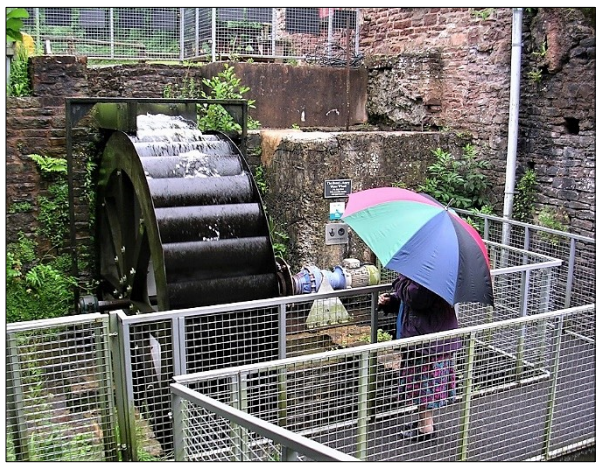
Water wheel installed in 2013 at the Forest of Dean Heritage Centre, Gloucestershire

Estimate the head of water from the outflow of the dam to the bottom of the wheel, if the height from the lady's feet to the tip of the umbrella is about 1.7m.