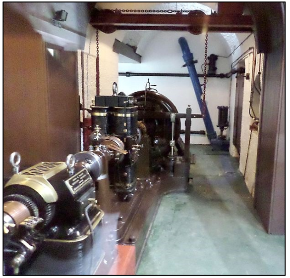
The turbine house at Cragside (file licensed under the Creative Commons Attribution-Share Alike 4.0 International license)

Falling water can also be used to generate electricity, when it is referred to as hydro-electric power (HEP). The first house in the world to be powered by HEP was Cragside, the country home of an industrialist, Lord Armstrong, in Northumberland in 1878. Although a simple water wheel can be used to generate electricity, it is more efficient to use a turbine, where the blades are curved and are confined within a tubular metal casing, as at Cragside. In principle, all it needs is a reliable flow of water and a sufficient "head" of water. The head is the drop in height from the water source to the water wheel or turbine. This small scale invention rapidly led to the development of HEP on a huge scale and it now makes a major contribution across the world. In fact, the world's top six power stations today, in terms of output, are all hydro-electric.