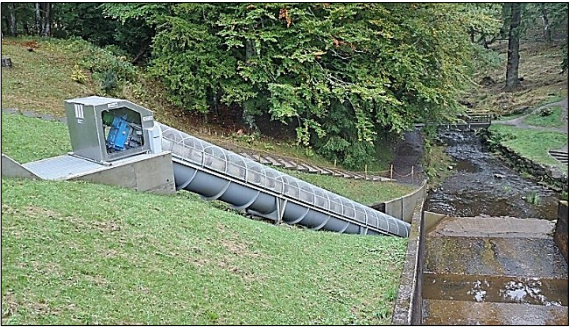
A new 17m long Archimedes screw installed at Cragside (file licensed under the Creative Commons Attribution-Share Alike 4.0 International license)

The Cragside Archimedes Screw: In addition to the earlier turbine at Cragside, an Archimedes screw was installed recently, fed from a series of lakes. At the time, the National Trust stated, "It will help us meet our target of halving our fossil fuel use and generating 50% of our energy from renewable sources by 2020" (<u>Hydropower returns</u> to Cragside | National Trust)