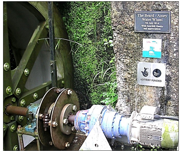
Close up of the generator at the Forest of Dean

The micro-hydro equipment in the photographs was installed in exactly the same place below the mill dam as an old water wheel, which had been used to drive a sawmill, before the days of electricity, and which had fallen into decay. Above the dam is a series of old ponds ensuring a good supply of water. The Trustees of the Heritage Centre raised about £50,000 to buy and install the brand new wheel and 7kW generator. The power is used in the Centre and any surplus is fed into the national electricity grid. The Trustees said: "From a green perspective we will be reducing our carbon footprint and generating around £8000 towards our energy costs per annum". https://www.theforestreview.co.uk/article.cfm? id=942&headline=Water