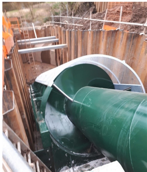
The River Dane Archimedes screw under construction (March 2021.)

The Dane Valley Archimedes Screw: The Dane Valley Community Energy scheme has installed an Archimedes screw in the river Dane, in Cheshire. There is a head of water of 4m and a steady year-round flow from the river. The total costs of the project are over £600,000, and the 65kW of electricity which it will generate has been bought by a large local firm. As a community project, £5,000 per year will also go to local charities, and provision has been made for education of local children and community groups. The pay-back time is expected to be 20 years.