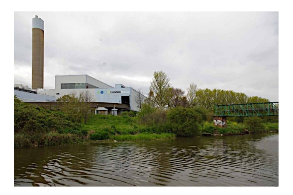
Edmonton Waste Incinerator, North London

However, in many areas of the world, domestic waste is burned to produce electricity.