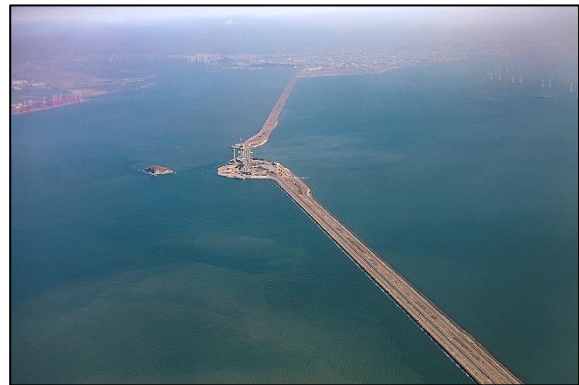
Aerial view of the Sihwa Lake Tidal Lagoon.

A tidal lagoon works on the same principle as a barrage, as water passes through turbines on the rising or falling tide. A lagoon of water is created behind a very long breakwater built out from the coast. The world's biggest example at the moment is the Sihwa Lake Tidal Power Station, in South Korea, which opened in 2011. The huge breakwater, 12.5km long, had already been built in 1994, to reduce flooding and to create agricultural land, so there were no further costs for building that part of the project. The average tidal range is 5.6m and the generating capacity is up to 254MW.