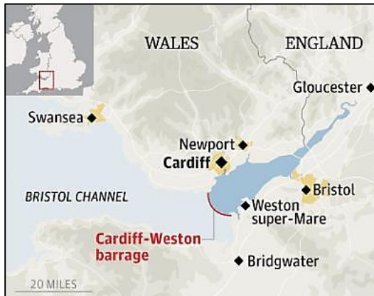
The location of the proposed Severn Barrage

If you live inland, search for an example of an actual or proposed tidal power station on the internet and answer the same two questions. A good example is the proposed tidal barrage across the estuary of the River Severn in England.