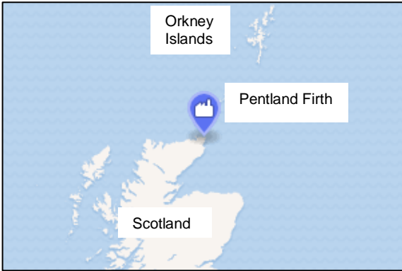
Map of the location of the MeyGen Tidal Power Project in the Pentland Firth, Scotland.

The tidal current between the north coast of Scotland and the Isle of Stroma in the Pentland Firth is one of the fastest in the U.K. and flows at speeds of up to 5m/s (11 mph) – certainly enough to be felt on the boat crossing to the Orkney Islands! There is no need for a barrage, but the turbines are fixed to the rocky sea floor and generate electricity when the current passes either way across them. The project is designed to deliver up to 400MW and its first phase (1A) began generating commercially at 6MW in 2017. Phase 1A of the project comprises four 1.5 megawatt turbines. These can generate the electricity needs of 3800 “typical” homes in the U.K.