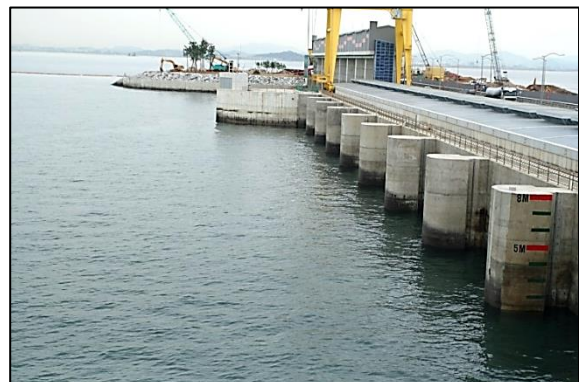
The turbine housings and power station at Sihwa Lake.