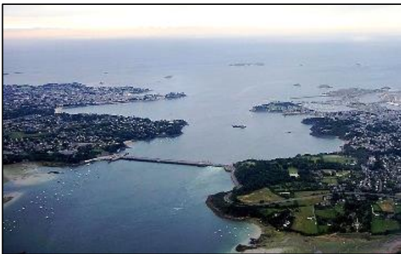
Aerial view of the barrage across La Rance Estuary, Brittany.

A barrage is a long wall built across a tidal estuary where there is a good rise and fall of the tide. La Rance Barrage, 750m long, was built right across the estuary of the Rance River in Brittany, Northern France and has been generating up to 240 Megawatts (MW) of electricity since 1966. The average tidal range here is around 8m. The incoming tide is allowed through sluice gates in the barrage. When it reaches its peak the gates are closed, and it is held while the water level outside the barrage falls. When there is enough gap between the two, the water inside is allowed to flow out through turbines, generating electricity as it goes. The electricity is produced by 24 turbines, set in the barrage. It has been estimated that La Rance Tidal Power Station supplies 0.012% of the total power demand of France.