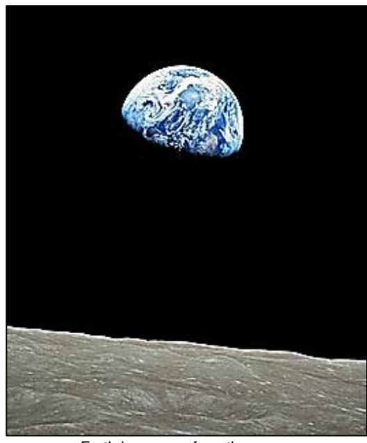
Earthrise - seen from the moon.

In a lunar eclipse, the alignment is Sun – Earth – moon. The Sun would be completely hidden by the Earth and the dark side of the Earth would be facing you (a 'new Earth'). You can gauge the relative sizes of the Earth and the Sun by thinking about the view of the Earth from the moon, as in the image below, and the size of the Sun, as seen from the Earth during the day (not sunrise or sunset, when the Sun's image is enlarged by the refraction of the atmosphere). So the Earth appears much larger than the Sun.