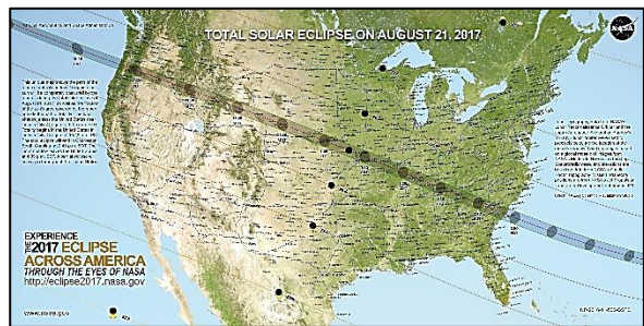
Map of the 2017 total solar eclipse across parts of the USA.

During a solar eclipse the alignment is Sun – moon – Earth. So, from the moon you would see the moon's shadow pass across a fully-illuminated Earth (a 'full Earth'). The size of the shadow can be gauged from this map of a total solar eclipse.