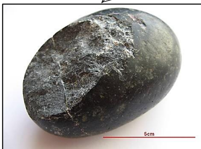
Peridotite of the asthenosphere, density of 3.23 - 3.27\text{gcm}^{-3}