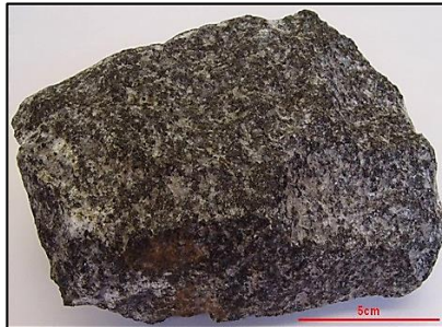
Gabbro, density around 2.94\text{gcm}^{-3}