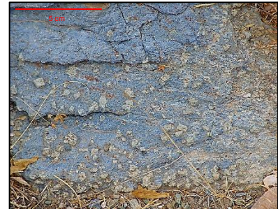
Blue schist, density around 3.08\text{gcm}^{-3}