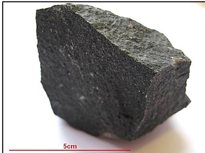
Basalt, density around 2.91\text{gcm}^{-3}

rises into the rocks above (shown by blue arrows). Meanwhile the mantle part of the oceanic lithosphere also becomes denser as it cools and the overlying pressure increases. Use the diagram to answer the questions below.