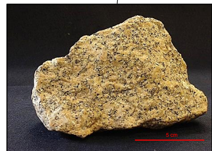
Granite, density around 2.66\text{gcm}^{-3}