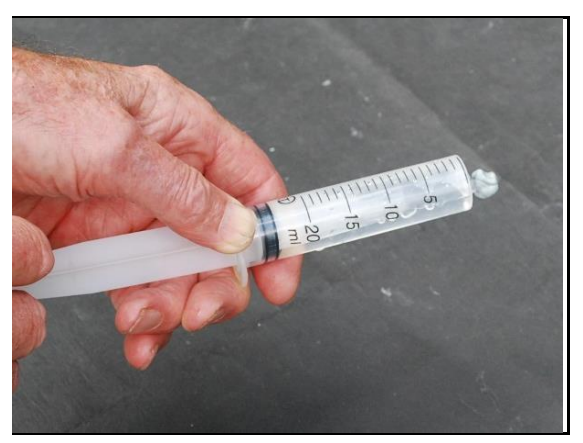
Water in the syringe beginning to boil and to produce bubbles of water vapour as the pressure is reduced by pulling back the plunger.

This can be demonstrated by releasing the plunger, so that it returns to its former position, without any air bubbles appearing. (Note that the plunger needs to be a good fit in the syringe and it is advisable to use a brand-new one where possible).