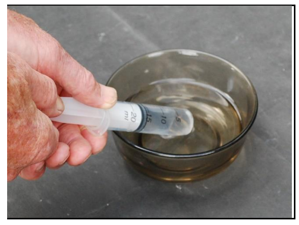
Filling the syringe with near-boiling water from a dish.

Does pressure have any effect on the temperature at which changes of state occur between solids, liquids and gases? Try this demonstration with your class (with due regard to safety, since hot water is involved). Boil some water and pour it into a small dish. From this, fill a 20ml syringe up to about the 15ml mark. (Ensure that air bubbles are excluded by working the plunger up and down a couple of times). Now seal the end of the syringe with a blob of Blutak<sup>TM</sup> or similar sealant.