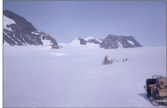
Travelling up the Starbuck Glacier. The bed of the glacier rests on rock and the ice is up to 700m thick at this point.

north of Cape Disappointment collapsed, producing floating tabular icebergs and much broken ice. As these melt, they will not affect sea level. However, the loss of the 'protection' from the Larsen A and B has led to a threefold increase in the rate of flow of the glaciers coming off the Antarctic Peninsula, which will affect sea level.)