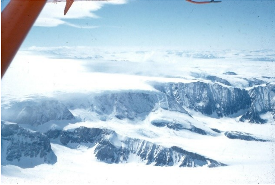
The ice cap on top of the Antarctic Peninsula, with glaciers in the foreground flowing down to the Larsen Ice Shelf

This activity investigates what will happen to sea level across the world when these ice caps melt.