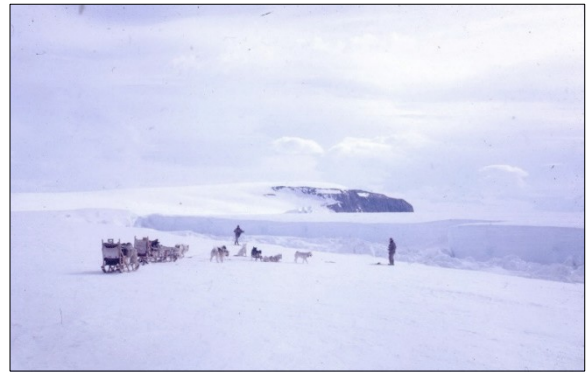
A 'rift valley' in the Larsen B Ice Shelf, near Cape Disappointment in 1963. The ice shelf is afloat in sea water and is about 300m thick in this area.