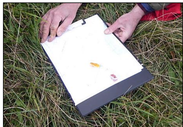
Sliced Jelly Babies™ 'revealing' a plunging fold in the field.

In the example of a plunging fold, measurements taken on bedding planes in the field showed that the sequence on the left was dipping at 35° to the East (red Jelly baby) while the sequence on the right was dipping at 30° towards the SSW (yellow Jelly Baby). The dip directions of the Jelly Babies are not at 180° to each other, showing that these are the limbs of a plunging fold (straight solid lines) and that the fold axis (dashed line bisecting the solid lines) was dipping towards you, towards the SSE.