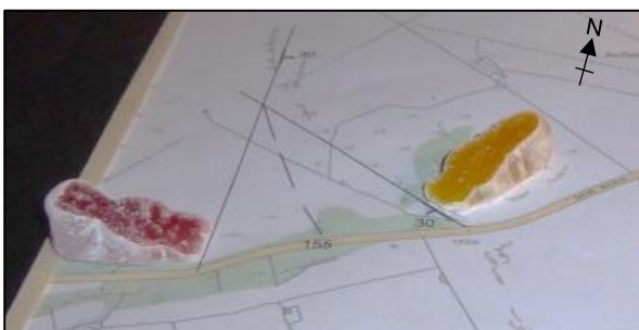
Plunging fold 'revealed' by sliced Jelly Babies™.

The Jelly Babies™ can be stuck on with a glue stick to ensure they are not easily moved.