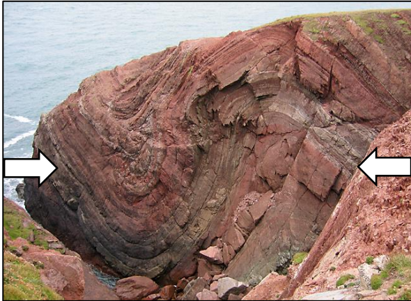
Devonian rock folded by near-horizontal compression, St Annes Head, Pembrokeshire, Wales.

Take your pupils to an area of folded rocks like these and ask them 'What was it like to be there – on the ground above where these rocks were being folded?'