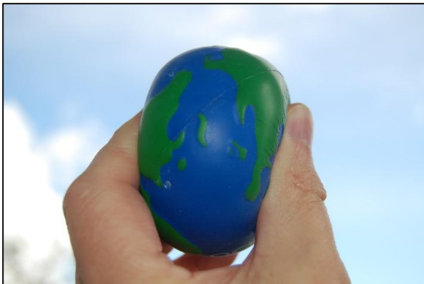
Squeezed soft ball. (Chris King).

As the rocks were squeezed by pressure from the sides, reducing the width of the area (and so causing crustal shortening) ask them where the squeezed material must have gone. Squeeze a soft ball to give them a clue. The answer is that the squeezed material must have gone up and down.