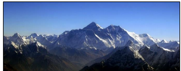
Aerial view of the Mount Everest range.

Now you can ask again 'What was it like to be there? – What would the view be like on the ground above where these rocks were being folded? They should answer that they would have been on top of a mountain range.