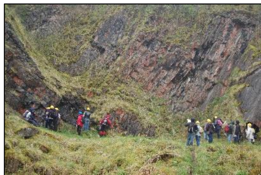
Pupils assessing the potential of a quarry. Apes Tor, Staffordshire, UK.