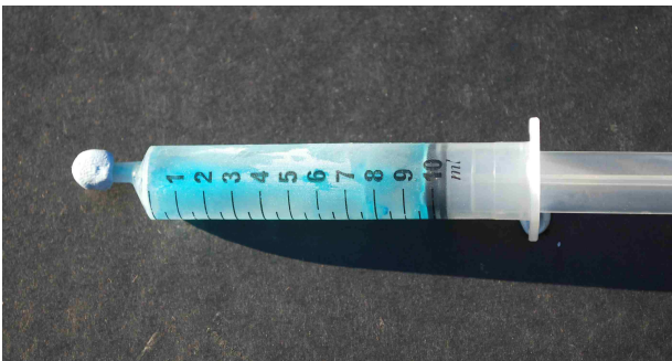
The syringe after freezing

Show pupils photographs of “frost damage”, but point out that it is the successive freezing and thawing that eventually weathers rocks down, rather than one single episode of freezing.