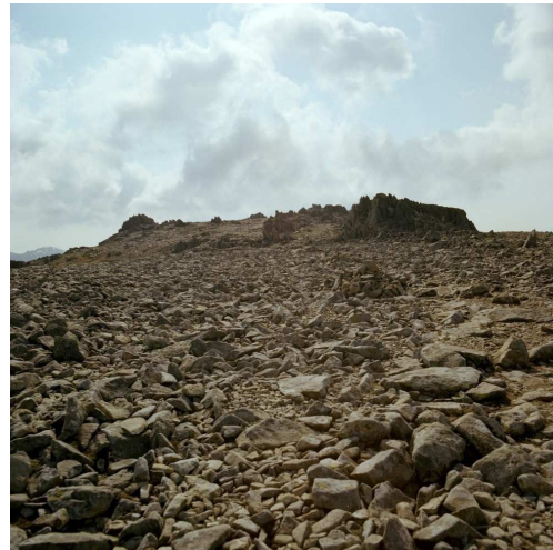
Rocks shattered by freeze-thaw weathering on Glyder Fawr, Wales, (Photo: P007204, BGS. Contains public sector information licensed under the Open Government Licence v2.0)

Ask pupils where on Earth freeze-thaw weathering is likely to be most active: