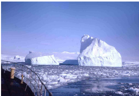
Icebergs near the Antarctic Peninsula