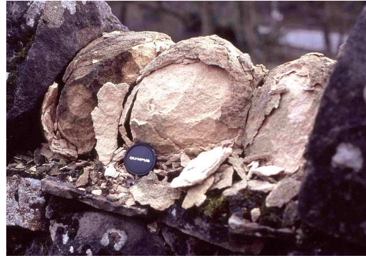
The effects of freeze/thaw weathering in a porous limestone

Show pupils photographs of “frost damage”, but point out that it is the successive freezing and thawing that eventually weathers rocks down, rather than one single episode of freezing.