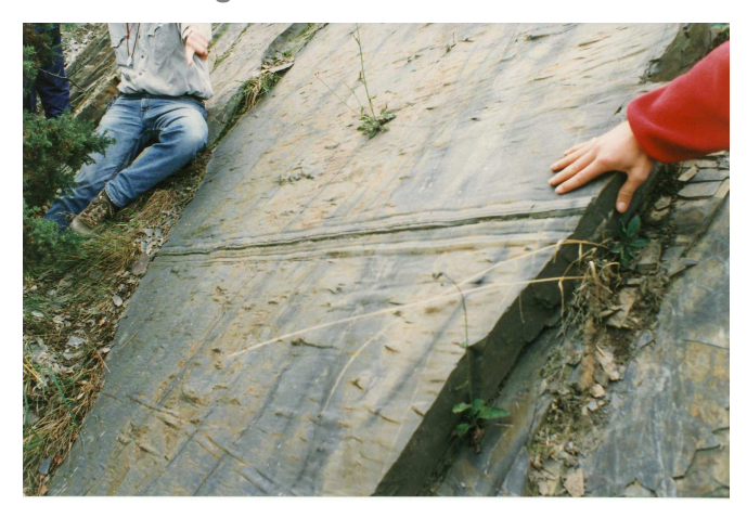
Photo 3. Sole casts, Aberystwyth Grits, Moriah, mid- Wales.