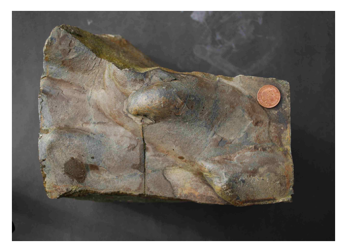
Photo 1. Sole casts, Aberystwyth Grits, Aberystwyth, Wales (coin is 2cm in diameter)

Now ask pupils to study the photographs of sole marks below. In each case, ask them: to name the type of sole marks shown; to work out the trend or direction of the ancient current; and to state if the sample is the right way up, or upside down.