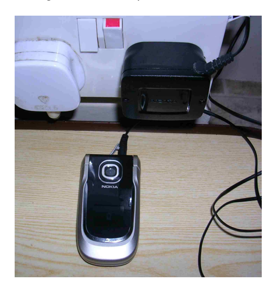
Recharging a mobile phone