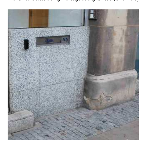
2. Facing stones made of grey granite and sandstone, Halifax Bank, Sheffield.