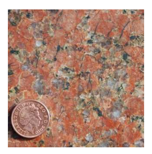
Ross of Mull Granite, Scotland