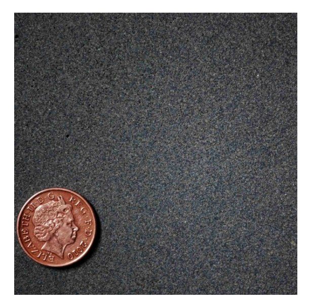
Basalt, Italy