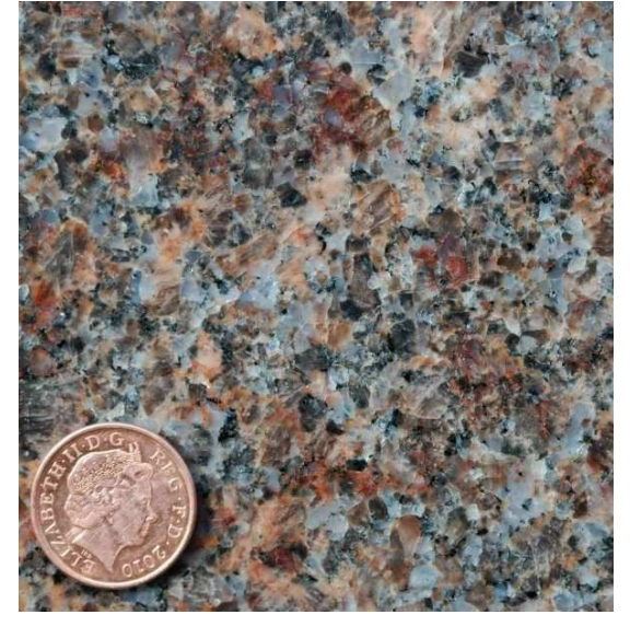
Imperial Mahogany Granite, South Dakota, U.S.A.