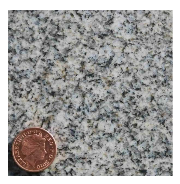
Kemnay Granite, Aberdeen, Scotland