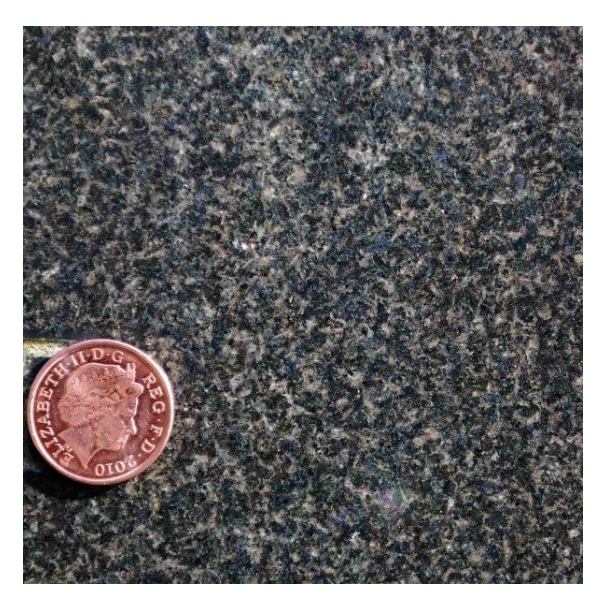
Gabbro, South Africa