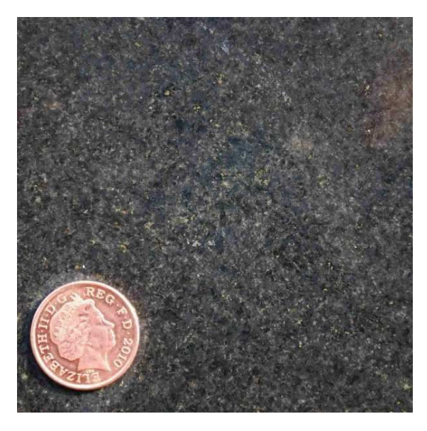
Dolerite, source unknown