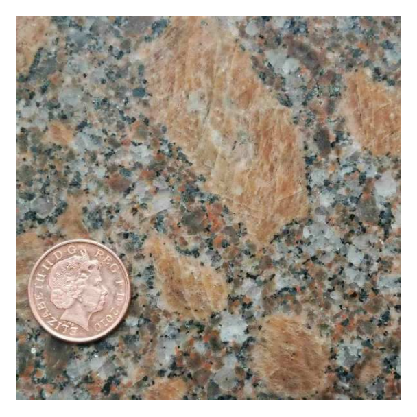
Shap Granite, Cumbria, England