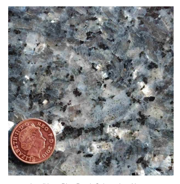
Larvikite - Blue Pearl, Oslo region, Norway