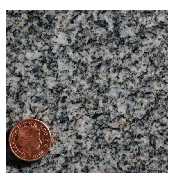
Rubislaw Granite, Aberdeen, Scotland