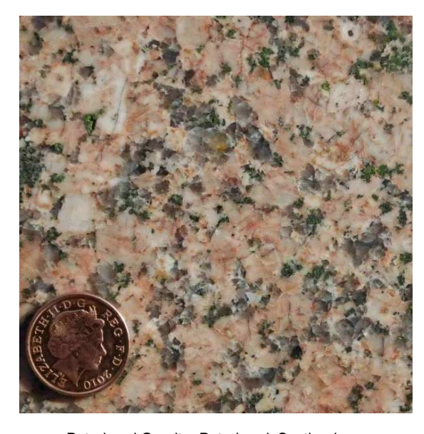
Peterhead Granite, Peterhead, Scotland