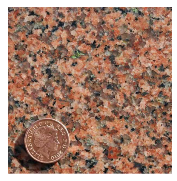
Balmoral Red Granite, Finland