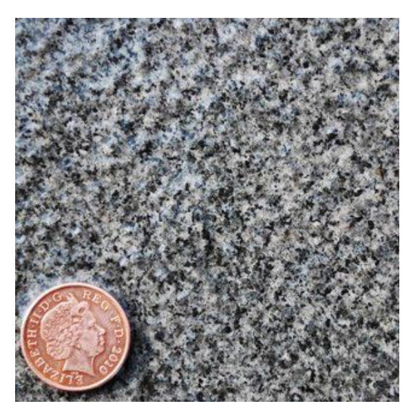
Alentejo Granite, Portugal