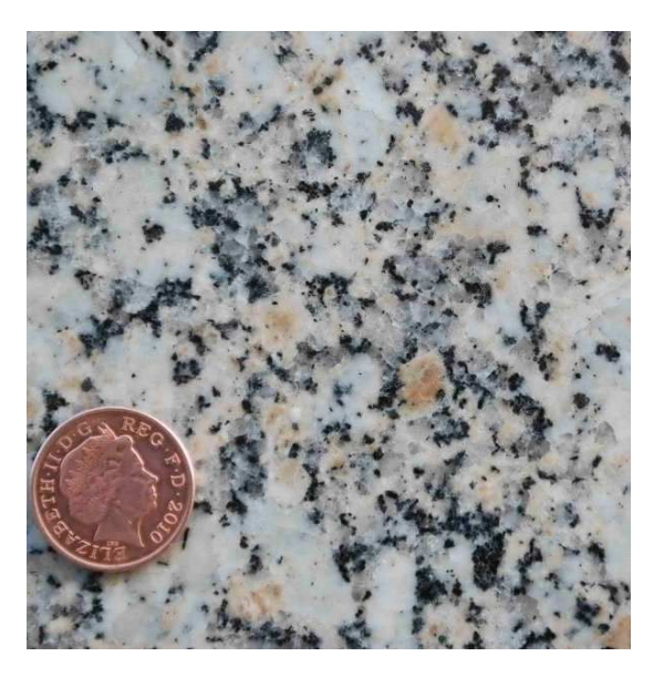
South West England Granite, England