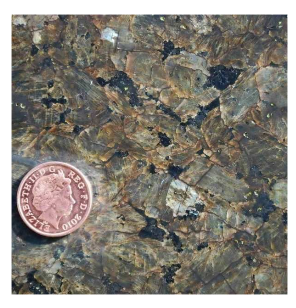
Larvikite - Emerald Pearl, Oslo region, Norway