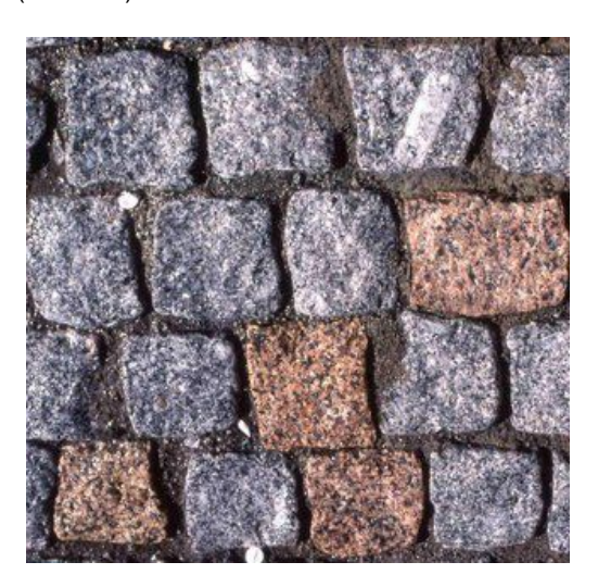
1. Granite setts, using Portuguese granites (Sheffield)