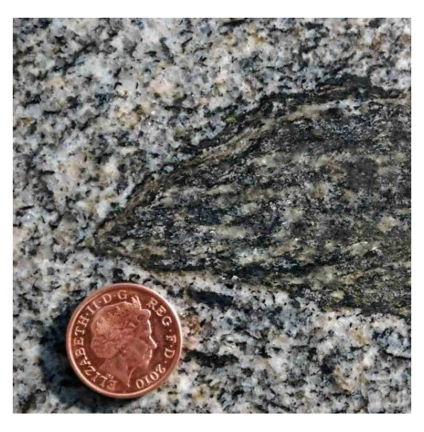
Rubislaw Granite with xenolith