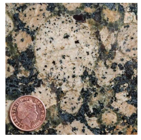
'Baltic Brown' Granite, Finland