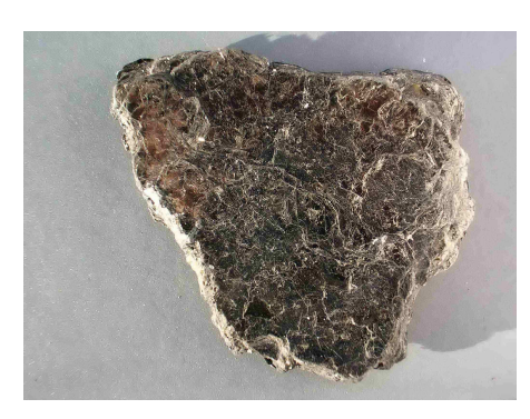
Mica, showing platy cleavage