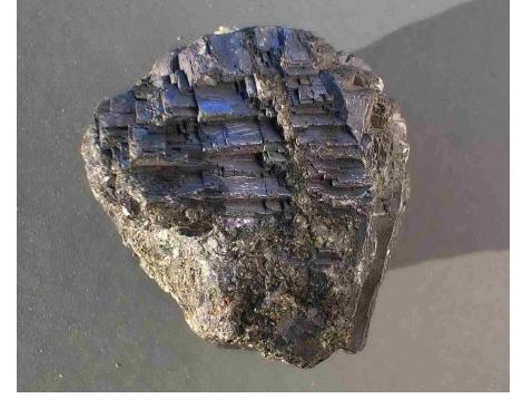
Galena, with cubic cleavage