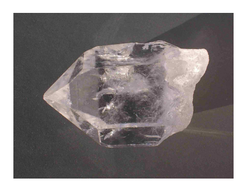
Quartz, showing prismatic habit