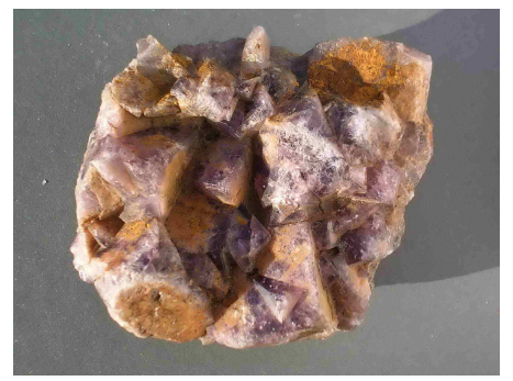
Fluorite showing cubic habit