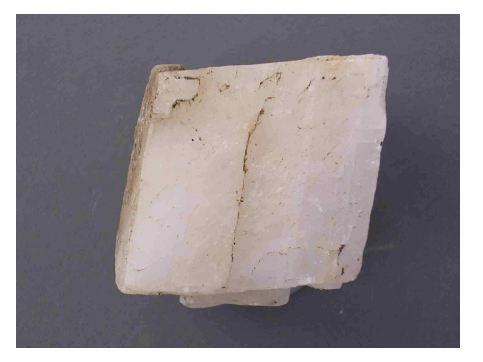
Calcite, (cleaved crystal) showing rhombohedral habit