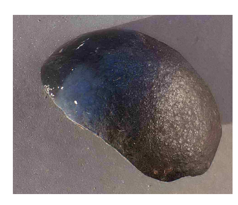
Haematite, "kidney ore"