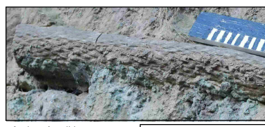
A plant fossil in a quarry – 'take it or leave it?'

Try 'thinking like a geoconservationist' by cutting out the cards on the third page, discussing them with your group, and putting them in the best place on the scale cut from the side of this page.