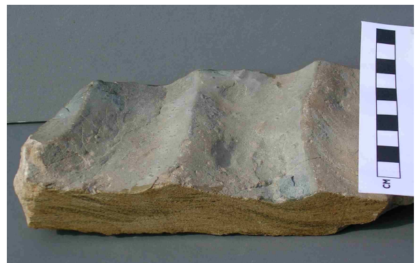
Symmetrical ripple marks