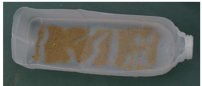
Symmetrical ripple marks in a drinks container

Source: Association of Teachers of Geology (1988) Science of the Earth, Unit 4. Building Sedimentary Structures - in the Lab and Millions of Years Ago . Sheffield: Geosupplies.