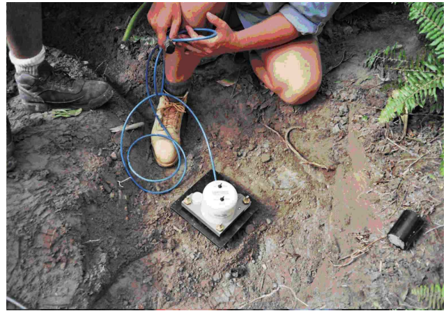
Tiltmeter in use on the volcanic island of Montserrat