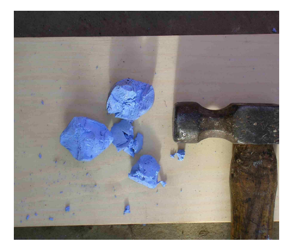
Brittle deformation when hit by a hammer

(You may also wish to demonstrate that the putty will shatter into small pieces when hit by a hammer, but don't do this if the room is carpeted or if pupils are wearing their best clothes – extracting bits of putty from textiles takes a lot of "dabbing" with a larger piece!).