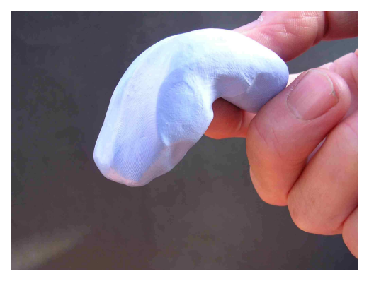
Plastic deformation under its own weight

Ask them to stretch out their piece of putty and hold it up so that it droops under its own weight (plastic or ductile deformation, or flow).