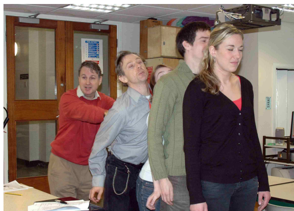
"Human molecules" taken by surprise as a P wave is transmitted through a "fluid"

Ask pupils to close up so that they are almost touching each other, but with their arms still at their sides. Warn the front pupil to expect a surprise, then ask the rearmost pupil to give a gentle shove. This will produce a "P wave" passing along the row, although the pupils do not always bounce back again as the real molecules would! This shows that a P wave can be transmitted through a fluid (liquid or a gas), in contrast to the S wave demonstrated above. (See photograph below)