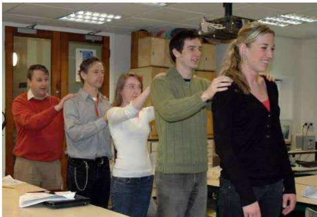
"Human molecules" representing a P wave being transmitted through a solid

Ask four or five pupils to stand in a row, with their hands on each others' shoulders, and their arms held rigidly, as shown in the photograph.