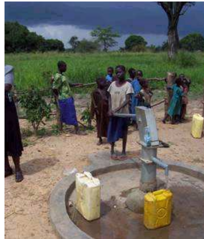
A hand dug well, Obelai, Uganda

Ask the pupils, if they wanted to get the water out of the 'ground' before it reached the 'spring', what they could do? The answer would be to dig or drill a well somewhere above the spring and pump out the water. Show this by digging a hole with a spoon - that will soon fill with water.