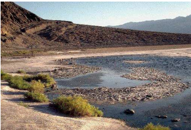
A natural spring in Death Valley, California, USA.

Pour water to fill the two cups. Soon you will see through the sides of the plastic container that the sand becomes wet and the water begins to flow 'downhill'. Ask the pupils where the water is likely to come to the surface as you continue to 'top up' the cups with water. Depending on how deeply buried the cups are, the water will appear somewhere near the cups or at the lower end of the container – in each case, the water appears as a 'spring', like in the photo. Eventually the water overflows the container into the tray beneath.