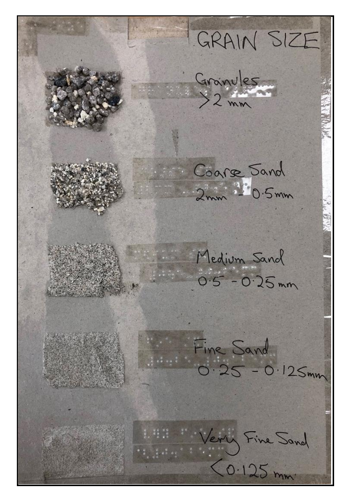
Fig: 3 A tactile grain size card made from sieved sand, thick card and PVA glue. The labels are made from self-adhesive braille strips, the writing was included to help the practical assistant. The tape around the edge of the card was added to make it durable enough to last the duration of the course.

In order to give a reference for the interpretation of clastic sedimentary rocks (such as the one shown in Fig. 2), a tactile grain size card was made from a poorly sorted sand sample that was sieved to separate the different grain sizes and then stuck to a piece of thick card with PVA glue.