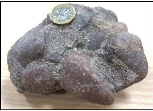
Fig: 2 A specimen of conglomerate that was used in teaching a student with VI. This specimen was selected as the different feel of the pebbles and the matrix allowed a student with VI to determine the size and shape of the pebbles, the grain size of the sandy matrix and from that to determine the sorting of the rock and to be able to draw independent conclusions about the processes that formed it.

In order to give a reference for the interpretation of clastic sedimentary rocks (such as the one shown in Fig. 2), a tactile grain size card was made from a poorly sorted sand sample that was sieved to separate the different grain sizes and then stuck to a piece of thick card with PVA glue.