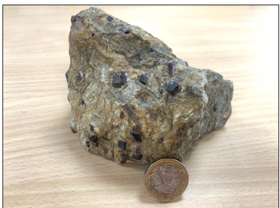
Fig: 1 Example of a garnet mica schist specimen suitable for tactile interpretation. The weathering of the surface has left euhedral garnet crystals protruding. The shape of these can be determined by touch and used to identify the mineral and an interpretation can be made independently by a student with VI.

Recent experience of preparing a student with VI (who was registered blind, with virtually no sight) for public examinations in geology required a new teaching approach in order to give this student a similar meaningful learning experience. This Earthlearningidea activity summarises some of the key lessons learnt from this experience.