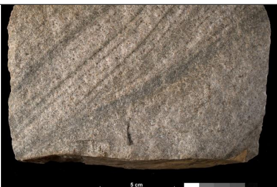
K. Hand specimen of a rock that does not react with acid