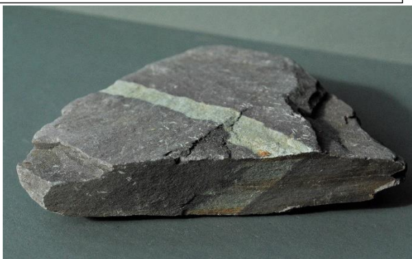
J. Hand specimen. Width of specimen c.10cm