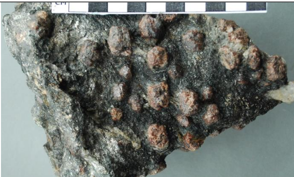
E. Hand specimen with smaller aligned crystals around large crystals.