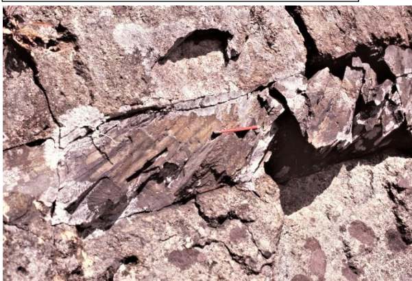
H. Rock exposure. Width of view c.1.5m