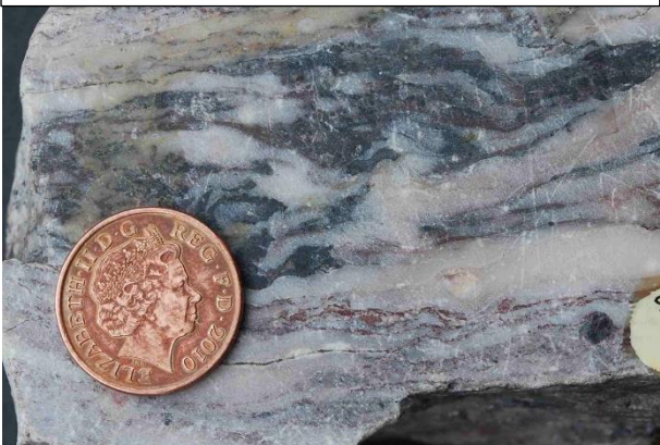
G. Hand specimen that reacts with dilute acid. Coin = 2cm