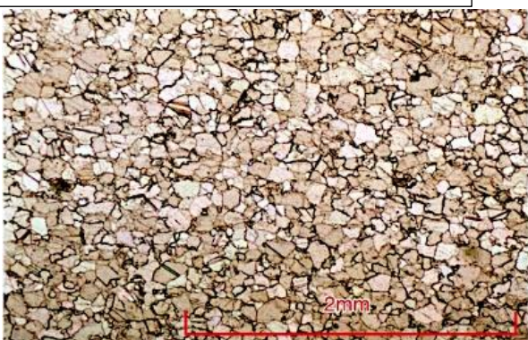
I. Magnified rock slice of a carbonate rock. Width of view c.3mm