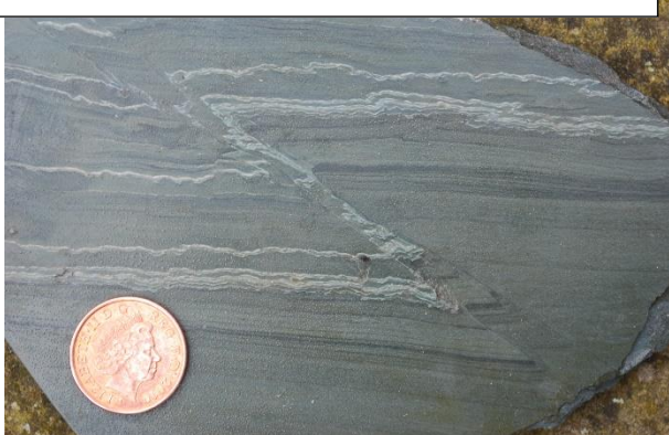
A. Flat surface of hand specimen. Coin = 2cm