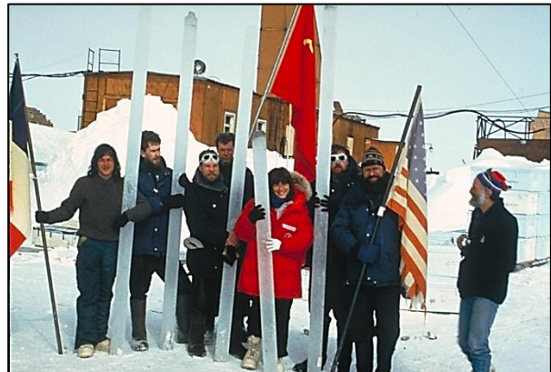
French, Russian and American scientists in the Vostok team photo, holding ice cores.