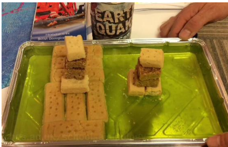
The jelly/biscuit model used to demonstrate seismic site amplification (video - http://www.earthlearningidea.com/Video/Mexico_City.html )

bedrock (biscuit) and an area of soft sediments (jelly). Give the jelly a few hours to set (e.g. in a fridge). Your model represents a place like Mexico City where the central part of the city is built on solid rock but the rest of the city is built on soft lake bed sediments. This means that different parts of the city only a few hundred metres apart respond very differently to earthquake shaking.