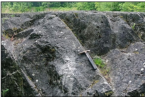
Tilted beds of Carboniferous limestone, as found near Tor Woods, Somerset, UK. The hammer lies along a bedding plane which once formed the sea floor.