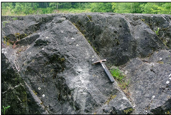
Tilted beds of Carboniferous limestone, as found near Tor Woods, Somerset, UK. The hammer lies along a bedding plane which once formed the sea floor.

Image by Wilson44691 released under the Creative Commons CC0 1.0 Universal Public Domain Dedication