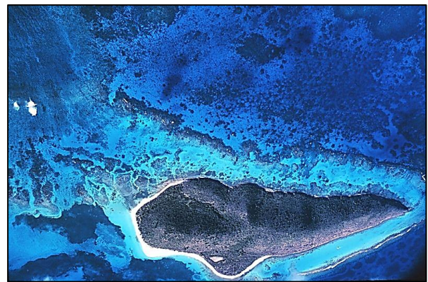
Aerial view of a tropical sea, the Virgin Islands, Caribbean Sea

The example summarised in the table below, shows how the questions might be answered. It is based on a field visit to limestone exposures of Carboniferous age in Tor Woods, Wells, Somerset, UK in October at 4.00pm. The limestone contains fossils of corals and shellfish (brachiopods) with thick shells, which show that the deposits were laid down in a subtropical, shallow, clear marine environment, like the Caribbean Islands of today.