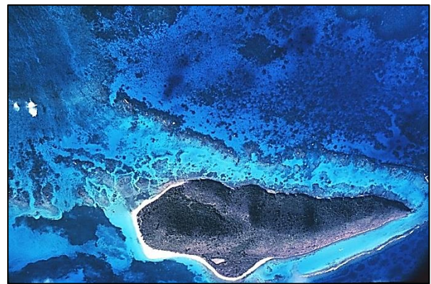
Aerial view of a tropical sea, the Virgin Islands, Caribbean Sea

The example summarised in the table below, shows how the questions might be answered. It is based on a field visit to limestone exposures of Carboniferous age in Tor Woods, Wells, Somerset, UK in October at 4.00pm. The limestone contains fossils of corals and shellfish (brachiopods) with thick shells, which show that the deposits were laid down in a subtropical, shallow, clear marine environment, like the Caribbean Islands of today.