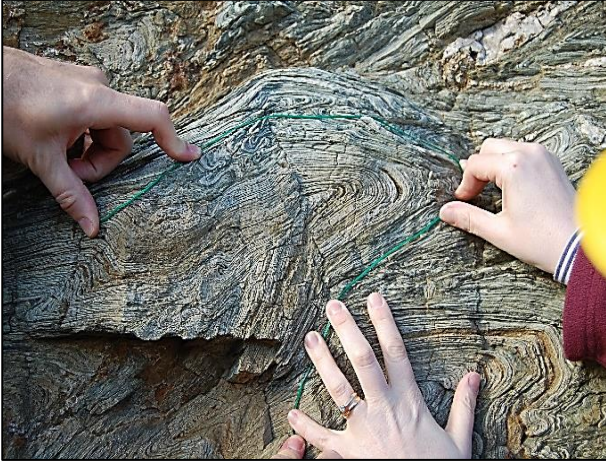
Measuring folds in the Precambrian South Stack rocks, Anglesey, UK..

Use a tape measure or a piece of string to measure around a fold (or folds) to give you the original length of the layer before folding. Then measure the new distance between the two ends of the string or tape, while it is still around the fold, to find out how far apart they are after being folded.