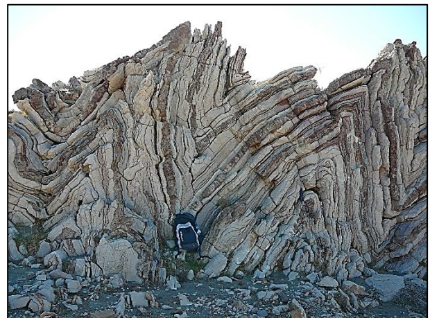
Folded rocks in Crete, the rucksack is 30cm across. (Pete Loader)

The method can be used in the field or on a drawing or a photograph like the one below.