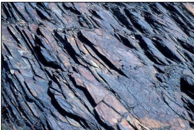
Slates in the Smokey Mountains, USA.