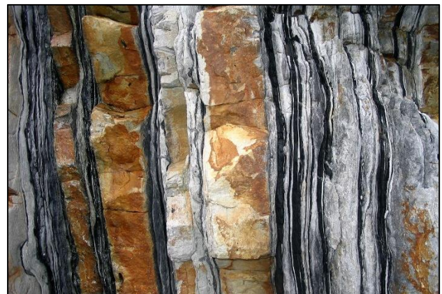
Alternating layers of schist (formed from mudstone) and metaquartzite (formed from sandstone) in Brittany, France.