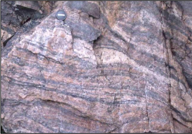
Banded Lewisian Gneiss, Torran Raasay, Scotland, UK (lens cap = 50mm).