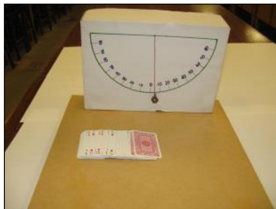
Figure 7b. Modelling failure in incompetent rocks – sliding.