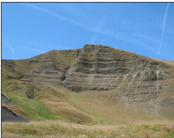
Figure 2. Alternating sandstone/shale sequence, where large and small blocks of sandstone topple and fall. The beds are dipping towards the camera. Mam Tor, Derbyshire, UK.

Mam Tor is formed of a Carboniferous age sandstone/shale rock sequence and is sometimes called the 'Shivering Mountain' because of the sandstone blocks which regularly topple and rain down onto the scree slopes at the foot of the face.