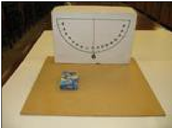
Figure 6a. Modelling failure in competent rocks – sliding.

Rocks behave in a competent way when they move as one mass.