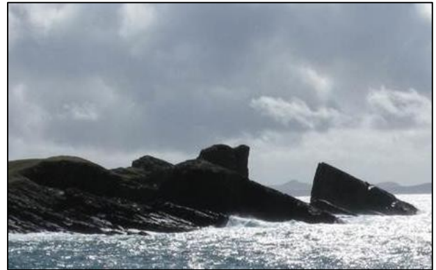
Figure 3. Bedding plane slip. The rock shaped like a shark's fin has slid down the bedding plane and into the sea. Clatchtoll, Sutherland, Scotland.

The effect of bedding plane slip is clear in Fig 3, where a massive block of Torridonian Sandstone has slid down the bedding plane, probably on a thin layer of mudstone.