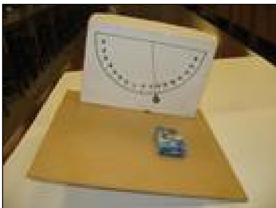
Figure 6b. Modelling failure in competent rocks – sliding.