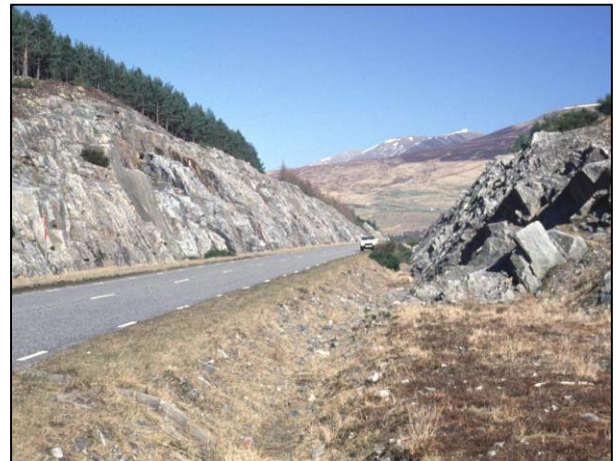
Figure 4. A road cutting through rocks which are dipping from right to left. The rocks on the right could easily slide down the bedding plane but the rocks on the left are relatively stable as they dip into the hillside.

The bedding plane slip process can be seen 'in action' where road cuttings cut through dipping rocks (Fig 4). Often the rocks have to be fixed in place (stabilised) using rock bolts or netting (Fig 5).