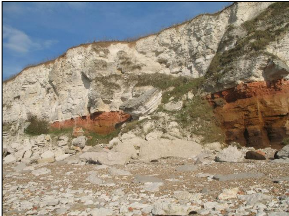
Figure 1. Toppling block failure where blocks of Chalk rock have fallen from the cliff top. Hunstanton Cliffs, Norfolk, UK.

Cliffs and slopes of sedimentary rocks can collapse in several ways, but two of the most common are toppling failure (Figs 1 and 2) and bedding plane slip (Fig 3).