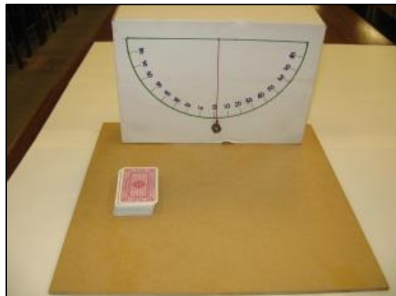
Figure 7a. Modelling failure in incompetent rocks – sliding.

Rocks move in an incompetent way when they break up and/or flow during movement.