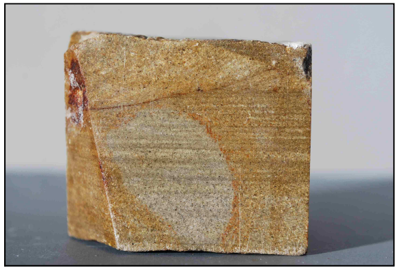
Photo 3: A small block of sandstone with cross bedding.

Show pupils Photo 3 and ask them to use the cross-bedding near the top of the specimen to work out the ancient current direction ( from right to left ).