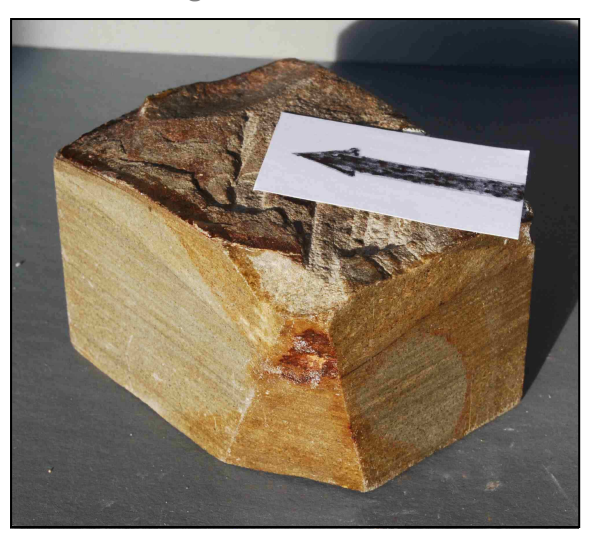
Photo 5: A three dimensional view of the same block of sandstone..

The answer in this case is from left to right . How can this be? It is important to realise that cross-bedding is a three dimensional property. Now show pupils Photo 5 and ask them to state the direction of the cross-bedding, now that they can see the three dimensional view ( towards the camera ). Finally, if the arrow is showing the direction of North, in what compass direction was the ancient river flowing? ( to the West, i.e. from the East ).