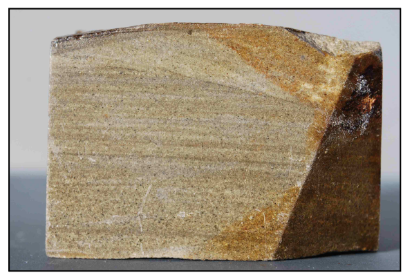
Photo 4: The same block of sandstone as in Photograph 3, turned through 90°. (Photo: Peter Kennett ).

Now show them Photograph 4 which gives a view of the same block turned through 90° and ask them to state the ancient current direction again.