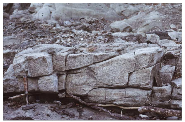
Photo 1. Jurassic-age cross-bedded sandstone in Swaziland.

Use Photo 1 to ask which way the current was flowing when this sandstone was deposited ( A. from right to left ).