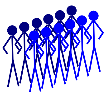
Metamorphic rock e.g. slate

2. Metamorphic rock - pupils stand with interlocking arms in rows to represent interlocking crystals which show alignment, e.g. slate