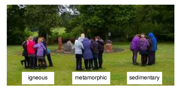
Pupils from Box Church of England primary school

Now you are ready to play the game. Pupils are divided into groups. The first group to get into the correct position for the rock group or rock mentioned gets one point. Of course, it is not necessary to play the game in a competitive way.