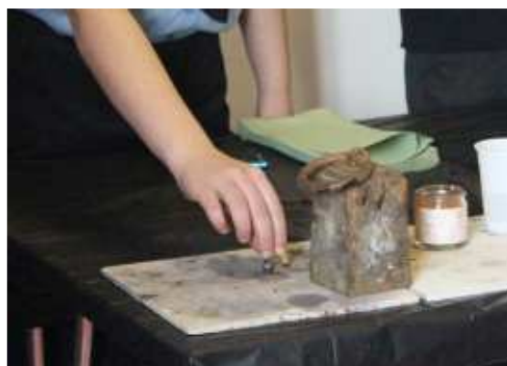
Step 4 – picking up iron crystals with a magnet, after crushing