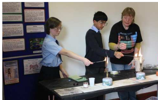
Step 3 – smelting iron oxide with charcoal