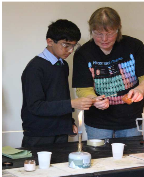
Step 2 – dipping the charcoal stick into iron oxide powder

Pupils may like to retain the iron crystals by picking them up on sticky tape and mounting them in their books.