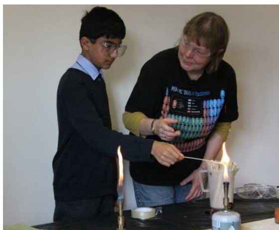
Step 1 – making a ‘charcoal stick’