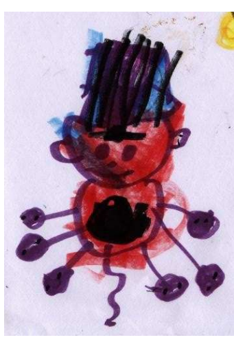
Manspimon, drawing by Tamsin Davidson, aged 5