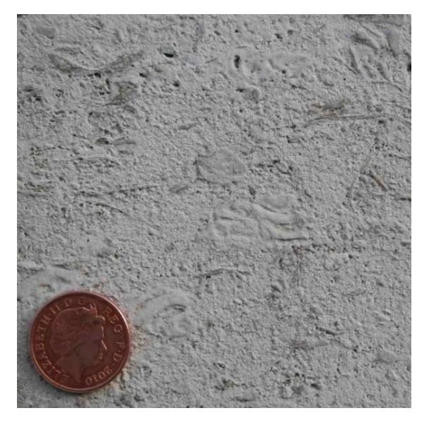
Portland Limestone (Jurassic), Isle of Portland, England