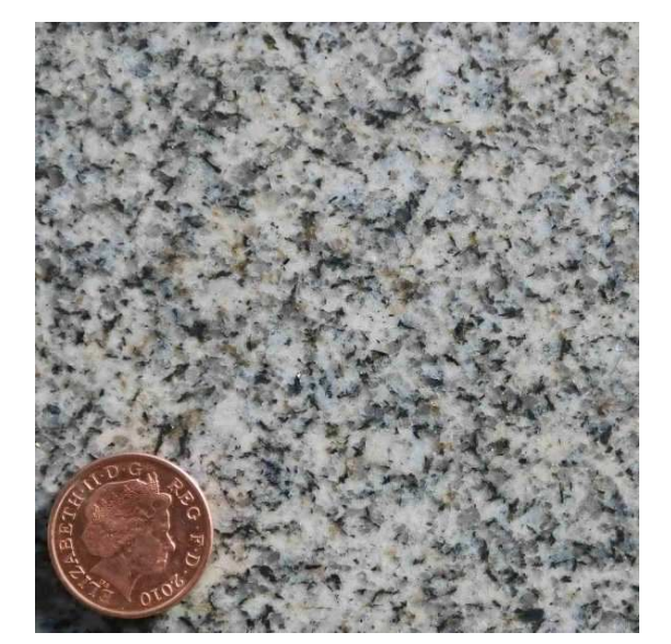
Kemnay Granite, Aberdeen, Scotland