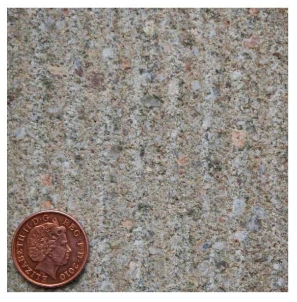
'Millstone Grit' sandstone (Carboniferous), Derbyshire, England