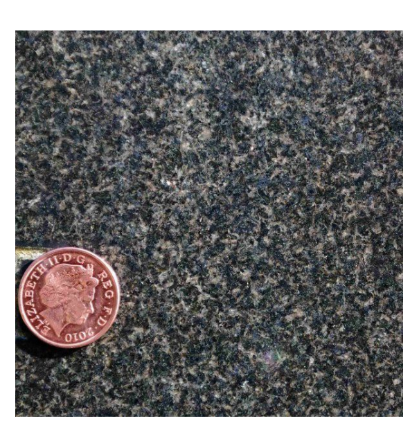
Gabbro, South Africa