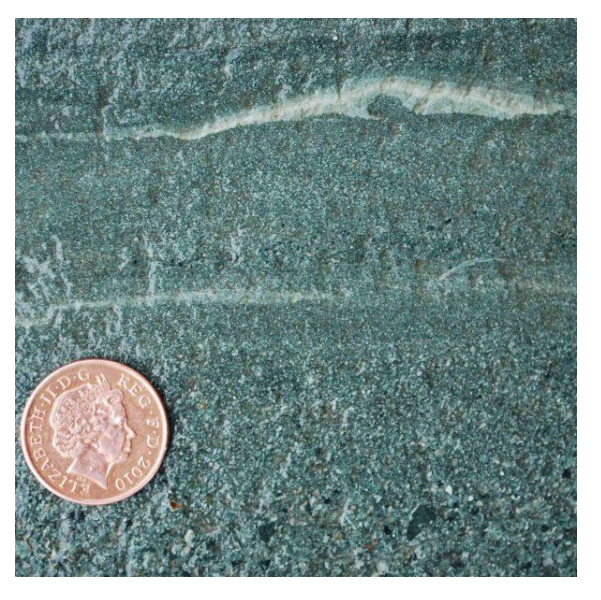
Broughton Moor Slate, Lancashire, England

Slate, with colour band from original bedding, North Wales