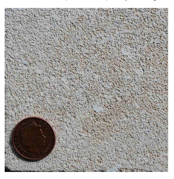
Bath Stone Limestone ('Stoke Ground, Top Bed', Jurassic ), Bath, England