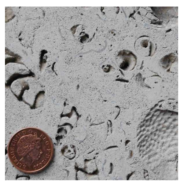
Roach Rock (Jurassic Limestone), Isle of Portland, England