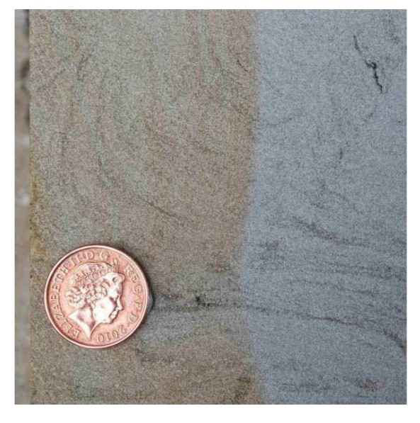
'Yorkstone', (Carboniferous), West Yorkshire, England (1p coin is 2 cm in diameter)