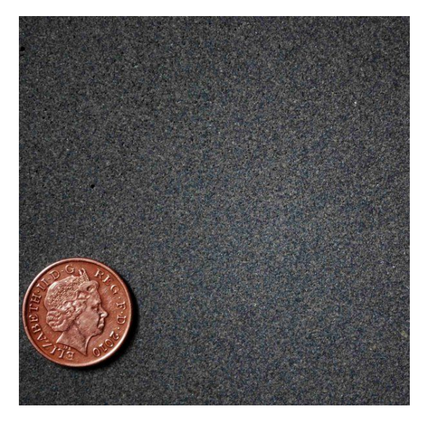
Basalt, Italy