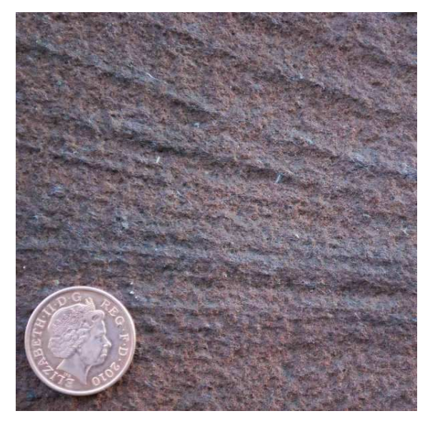
St Bees Sandstone (Triassic), Cumbria, England