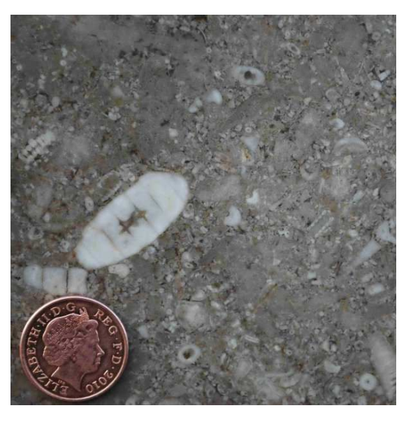
Crinoidal Limestone (Carboniferous), Derbyshire, England