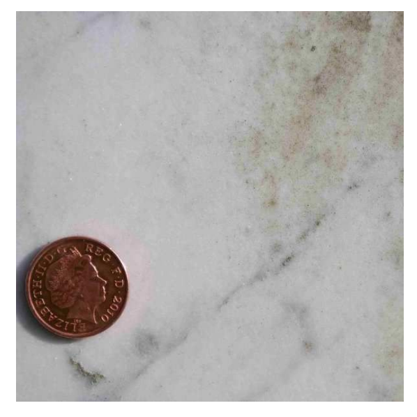
Marble, Carrara, Italy