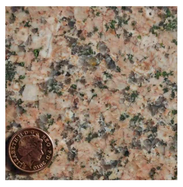
Peterhead Granite, Peterhead, Scotland