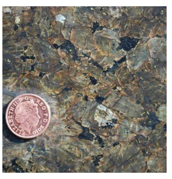
Larvikite - Emerald Pearl, Oslo region, Norway