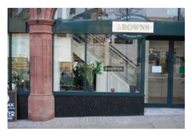
Building stones in a city centre – red sandstone and 'granite' make up the front of the café, whilst granites and buff sandstones form the paving. St Paul's Parade, Sheffield

natural scale. Arrange the cards in each set so that all the limestones (including travertine) and marble are separated. Since testing with acid is clearly not appropriate with photographs, tell pupils that the rocks shown on the separated cards would all react (fizz) with dilute hydrochloric acid, but that the others would not. (It will also be necessary to give this information when out with the class in a city centre, unless permission has been obtained to apply a drop of acid. Most graveyard managers will give permission for this test to be carried out on gravestones, since it merely results in a slightly cleaner-looking spot on the marble or limestone).