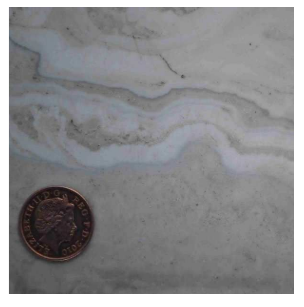
Travertine mineral spring-limestone (Pleistocene), Italy