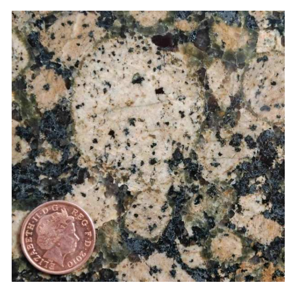
'Baltic Brown' Granite, Finland