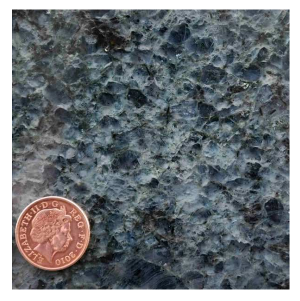
Verde Ematita, Argentina