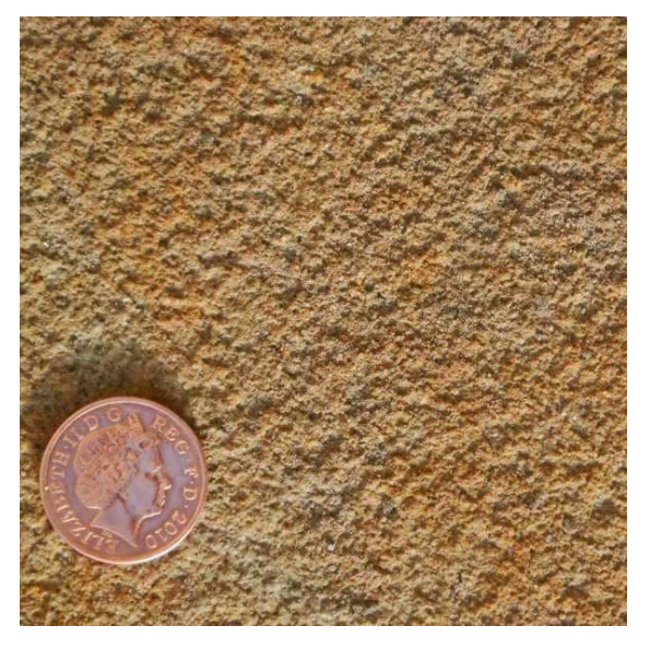
"Rockingstone", shot sawn sandstone, (Carboniferous), Huddersfield, England