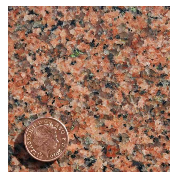
Balmoral Red Granite, Finland