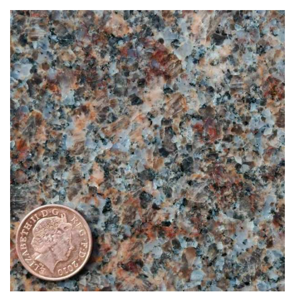
Imperial Mahogany Granite, South Dakota, U.S.A.