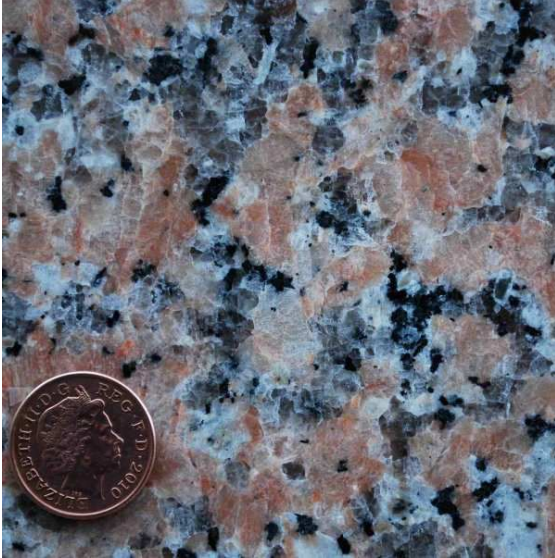
Rosa Porrino Granite, Spain