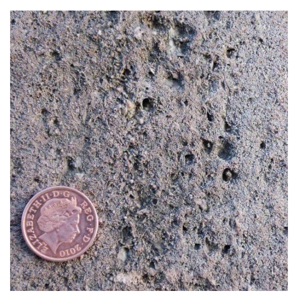
Ancaster Limestone (Jurassic), Lincolnshire