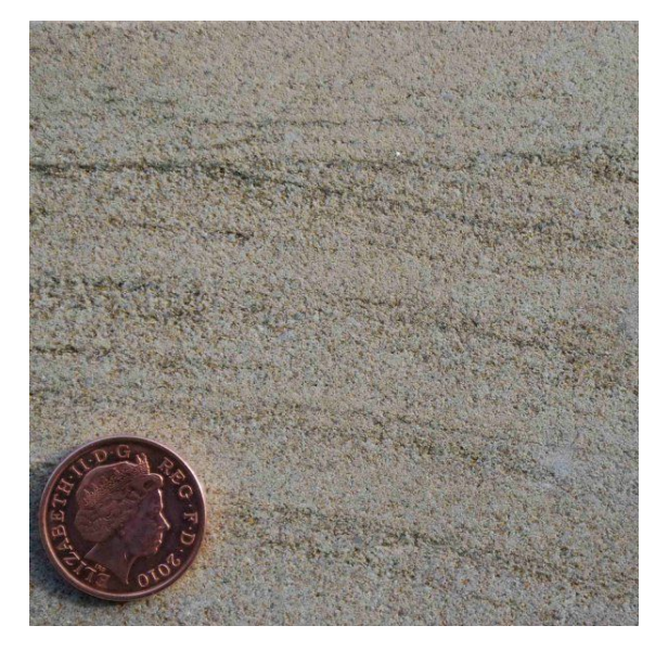
Cross-bedded sandstone (Carboniferous), Stanton Moor, Derbyshire, England