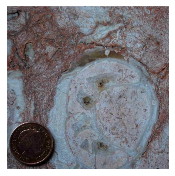
Rudistid limestone (Cretaceous), probably Portugal