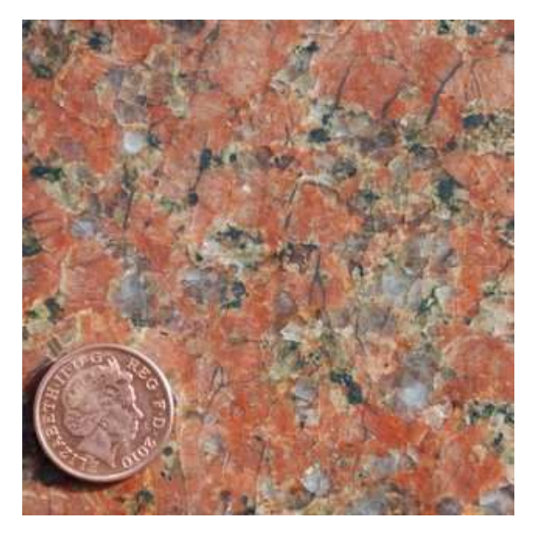
Ross of Mull Granite, Scotland