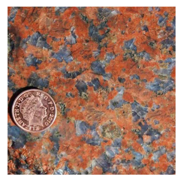
Rose Swede Granite, Sweden