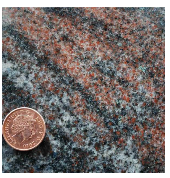
Gneiss, ('Paradiso classico'), India