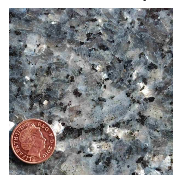
Larvikite - Blue Pearl, Oslo region, Norway