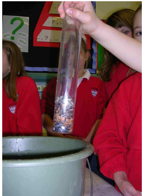
A jig being used to separate galena, barite, fluorite and calcite from a crushed sample

Point out that this method was used for several centuries by miners, who mainly wanted the lead ore, called galena. Ask pupils how they could get the galena out of the jig. Then show them the photograph of the full scale reconstruction, and point out that it was big enough for a boy to climb in and shovel out the minerals from their different layers.