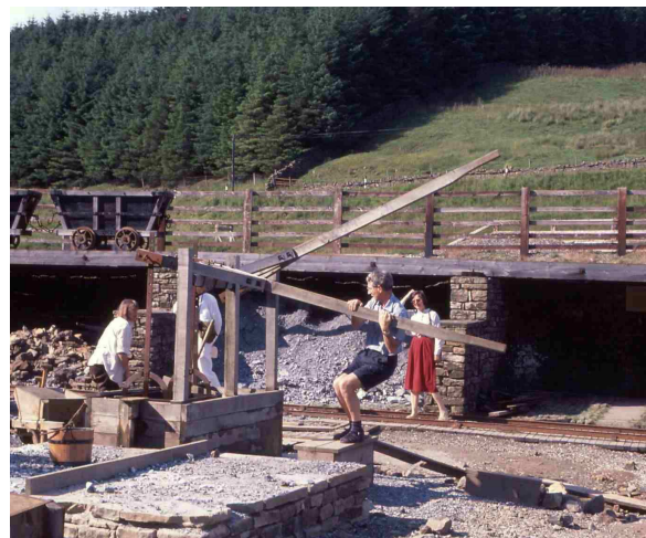
A full-size reconstruction of a jig on the ore-dressing floor at the Kilhope Mining Museum, County Durham