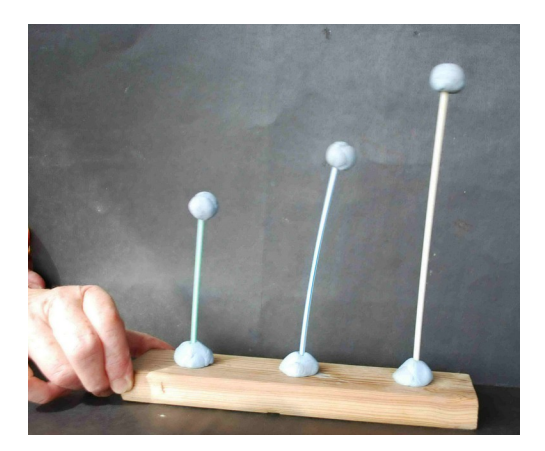
Photo 2: Blutak<sup>TM</sup> 'buildings', secured to a wooden base by more Blutak<sup>TM</sup>. The middle 'building' is swaying as the base is moved backwards and forwards on the table top. ( Photo: Peter Kennett )

Photo 1: Model 'buildings' of different heights, using heliumfilled balloons ( Photo: Peter Kennett )