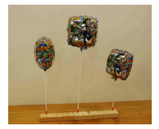
Photo 1: Model 'buildings' of different heights, using heliumfilled balloons

Make up a model as shown in either of the two photographs, depending on what materials you have to hand.