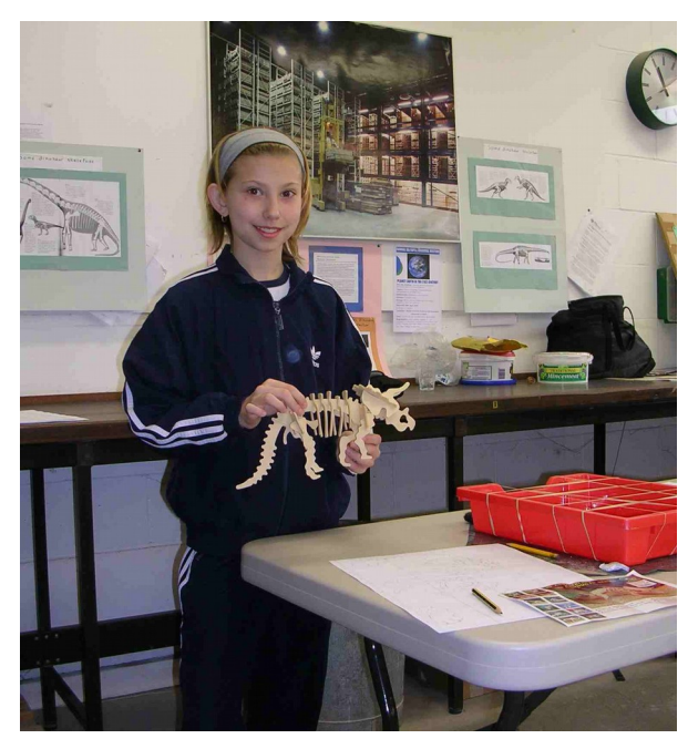
The reconstructed skeleton proudly displayed