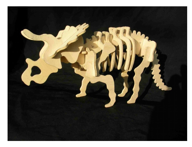
A reconstructed Triceratops model

When the pupils have finished, they should see if they can reconstruct the dinosaur (or chicken!).