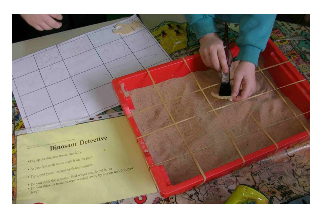
Digging up the dinosaur – very carefully!